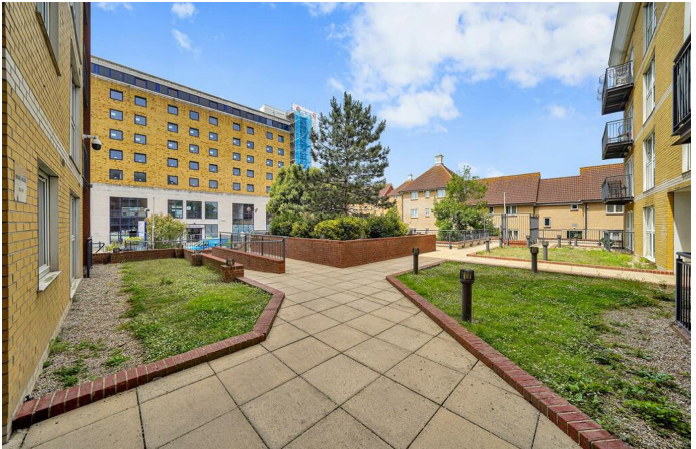
Regal House Royal Crescent, Ilford, IG2 7JY